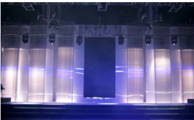
Stadiums, industrial roofing, swimming pools, cladding and public areas