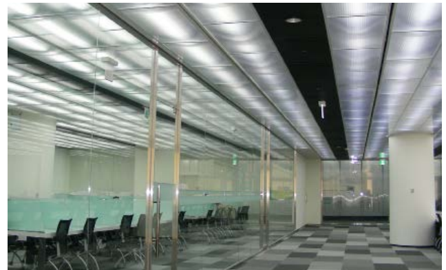
Interior Design - Lighting