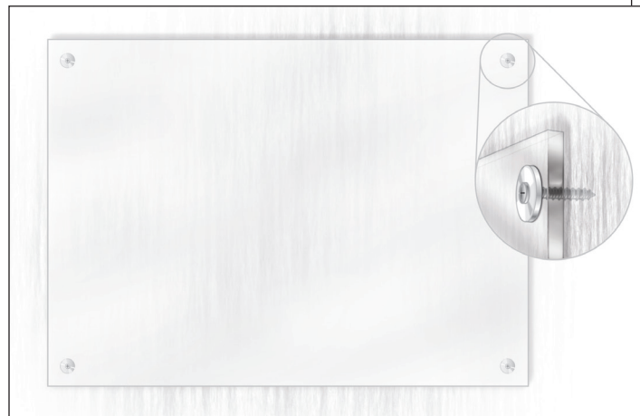
Screw / Washer attachments on corners

Additional information can be found in TUFFAK CA fabrication guidelines at www.plaskolite.com