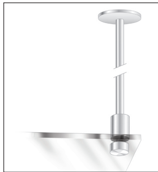
Ceiling Stand-offs / Hanger bars